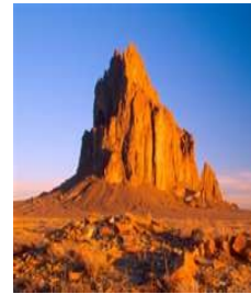
Shiprock Navajo Fair 2011 Sept. 28th-Oct.