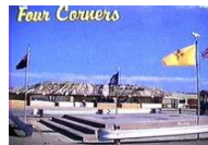
Four Corners Monument